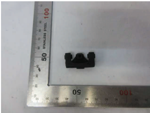
Sample No. 3