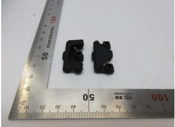
Sample No. 3-1 (only BPA)