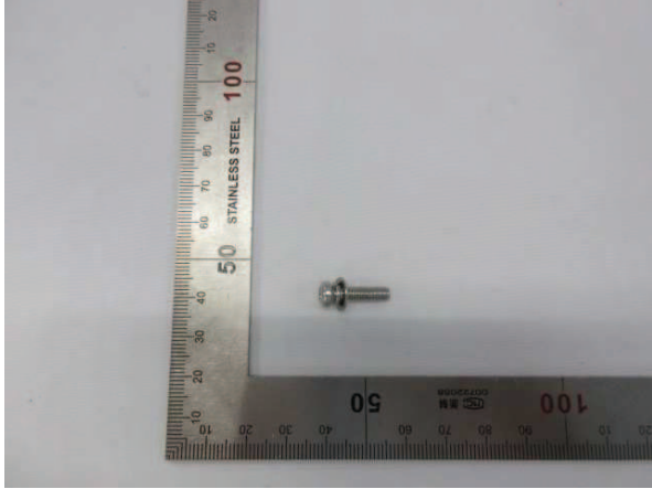
Sample No. 1