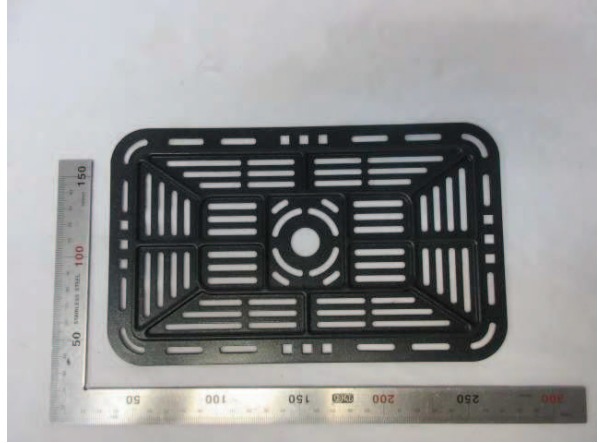
Sample No. 2, 2A